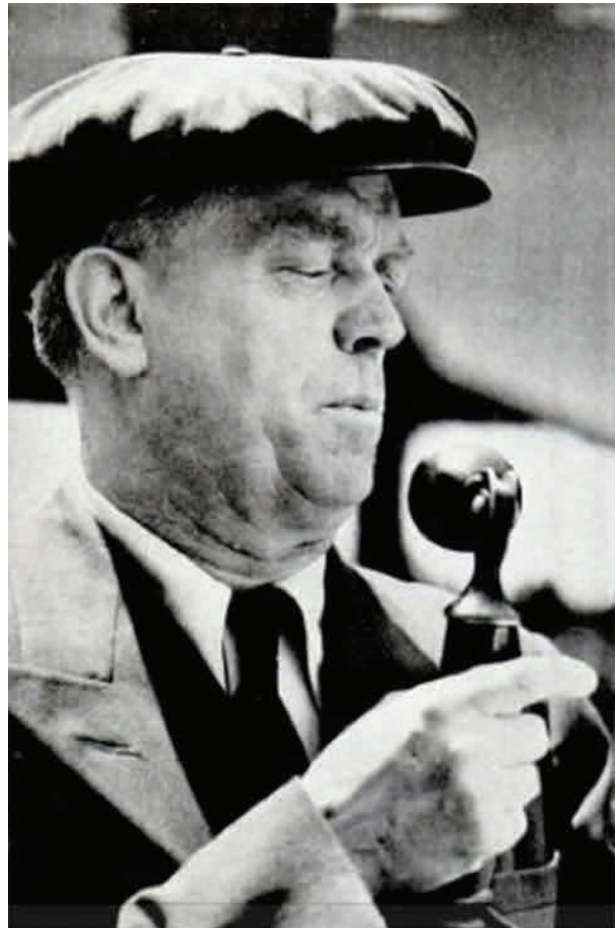
Did PA announcer Pat Pieper reach into the dead-ball bag and give Al Dark a third baseball involved in the caper?

The game was designed for one ball at a time. But two? And now the possibility of three total in one play? Obviously, the follies occurred in the appropriate place.