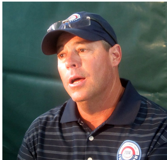
Hall of Famer Greg Maddux led the crop of good young players Dallas Green's farm system developed.