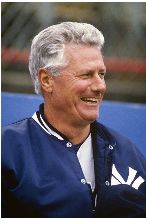
After leaving the Cubs, Dallas Green held a variety of jobs, including Yankees manager.