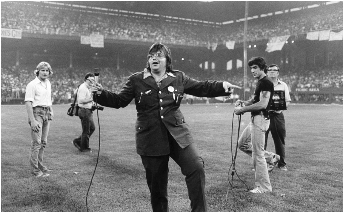
Steve Dahl in all his glory revving up the crowd on Disco Demolition Night.