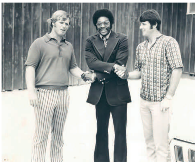
Ed Herrmann (left) and Bill Melton (right) welcome Dick Allen after he signed with the Sox in 1972.