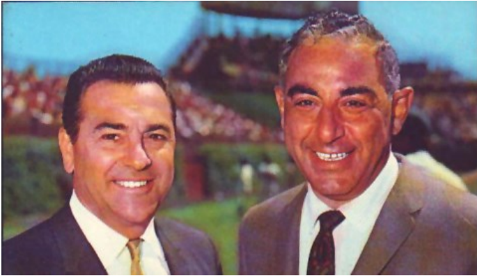
The Rings' tape of the Doggett-Koufax interview confirms WGN ran it when Cubs announcers Vince Lloyd and Lou Boudreau introduced the segment on the station.

show, cleaned up the staticky version via digital gerrymandering as best as he could. The boosted version of Doggett-Koufax appeared on Diamond Gems .