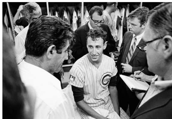
Ken Holtzman talks to reporters in the Cubs clubhouse after his first no-hitters on Aug. 19, 1969. On Sept. 25, 1966, in his only head-to-head matchup against Sandy Koufax, in Chicago, Holtzman took a no-hitter into the ninth inning before hanging on to win 2-1.