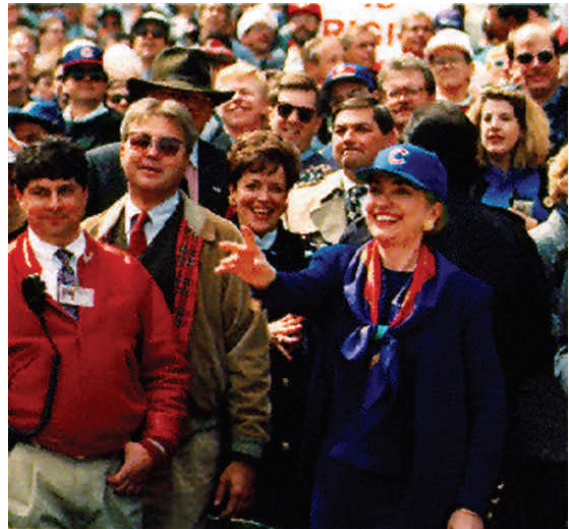
Hillary Clinton throws out first ball at Wrigley Field in 1994.