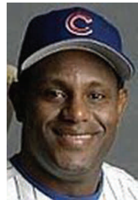
After Sammy Sosa was caught red-handed, the Cubs stashed away multiple corked bats when informed the commissioner's men were on the way.

And now, with home cooking in the World Series, the baseball gods have abruptly evened up much of the above. But the bizarre journey down the red-brick road will never be forgotten. In many cases, it will evoke grins. Might as well smile instead of cry.