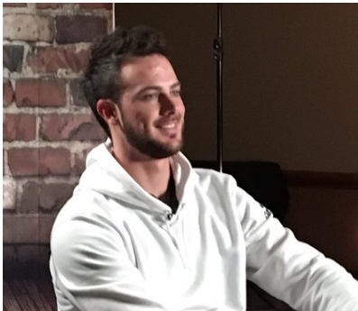
Kris Bryant, who made the assist for the final out of Game 7, shares his memories for the CSN Chicago crew.

Game 7 in 2016 was good enough. The producers saved their visual style points for start and finish. “Reign Men” has an opening scene of raindrops inundating a small area, emblematic of the rain delay that turned around the Cubs’ fortunes. And the show ends not with the bar crowd whooping it up, but with home video of fans bouncing off their living-room walls celebrating. CSN Chicago had solicited the videos by a social-media alert. Those smaller, but wild, celebrations seem more legitimate than the tiresome shots of well-lubricated Millennials jumping around in a bar.