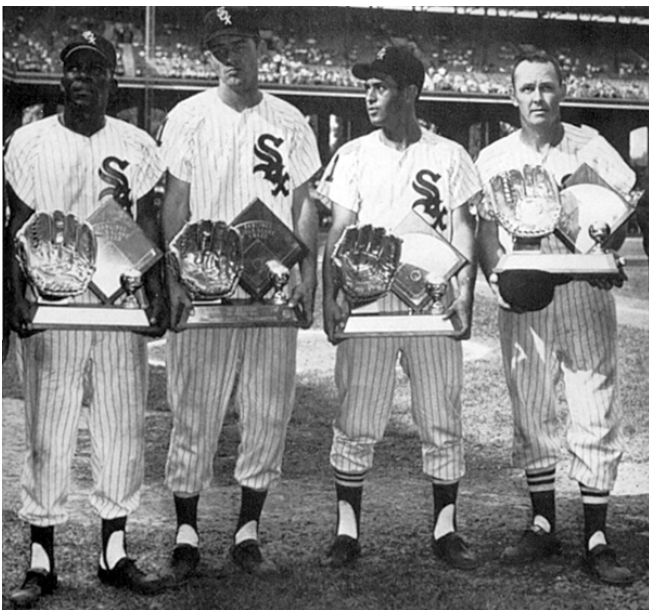
Minnie Minoso, Jim Landis, Luis Aparicio and Nellie Fox show their Gold Glove trophies to the crowd before a game at Comiskey Park.

In 1954, he had his second-straight fourth-place finish in Most Valuable Player voting; hitting .320 with 19 homers, 18 triples, 19 stolen bases, and 119 runs scored.