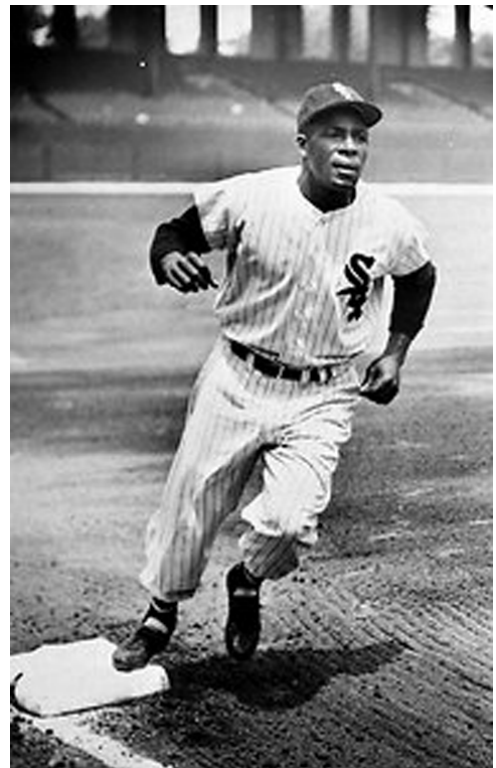
Minoso was one of the original "Go-Go" boys.