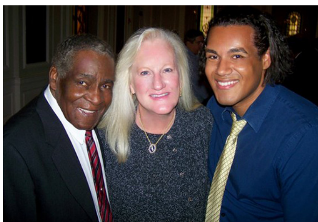
Minoso family at Chicago Baseball Museum event in September, 2012.

"Every young player in Cuba wanted to be like Minnie Minoso, and I was one of them," Hall of Fame slugger Tony Perez said. "The way he played the game, hard all the time, hard. He was very consistent playing the game. He tried to win every game. And if you want to be like somebody, and I picked Minnie, you have to be consistent." Perez in fact, openly campaigned for Minoso in his Hall of Fame acceptance speech in 2000.