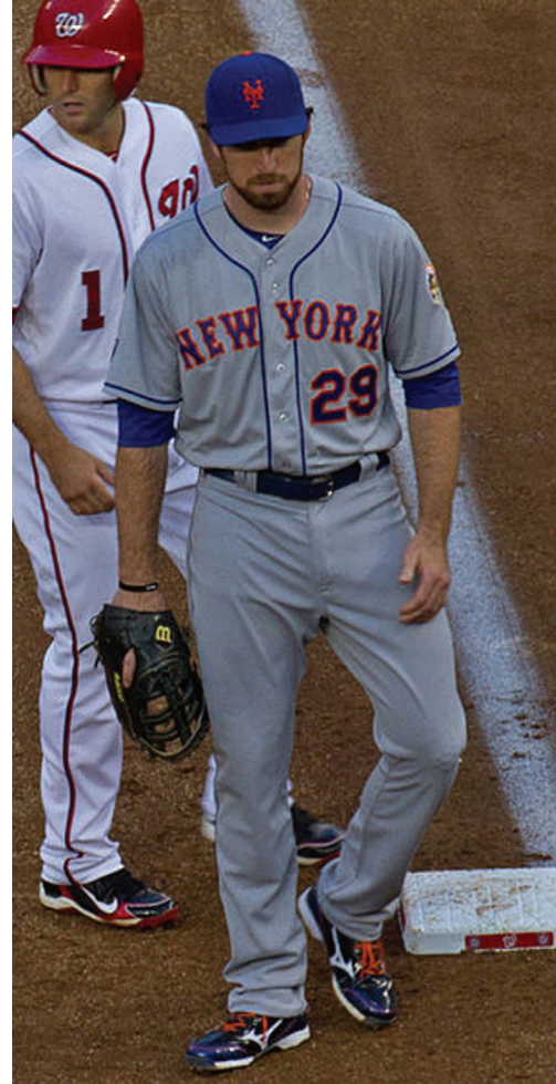
Will folks like Ike Davis as much as a Chief Executive nicknamed Ike?

More streets: Francisco Barrios; George, Buddy and David Bell; Troy O’Leary; Jack Warner; Milton Bradley; Corey, Ken and Bob Patterson; Scott Fletcher; Gene Nelson; Dave Clark; Wayne Nordhagen; Rodney Scott; Bill North; Randy Wells and Don Wells; Don Elston; Sammy