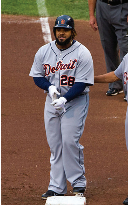
Prince Fielder as a royal baseball name, so to speak.